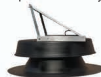
Steep Roof Position

When investing in a product to improve your home and quality of life, you want assurance it's performing efficiently and effectively. Natural Light Energy Systems combines precision-designed components with advanced engineering to produce a unit that far surpasses industry standards.