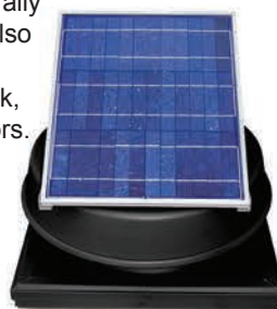
Curb Mount (12, 24, 36, or 60 watt)

Designed for all types of applications, the Solar Attic Fan is available in three mounting types. The roof mount and gable mount are generally for residential use. The curb mount is generally for commercial use but can also be installed on homes. Units may be ordered in gray, black, bronze, or other custom colors.