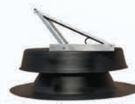
Medium Slope Position