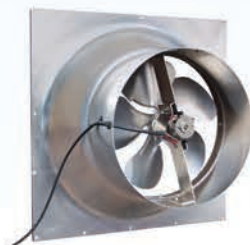
Gable Mount (12, 24, 36, or 60 watt)