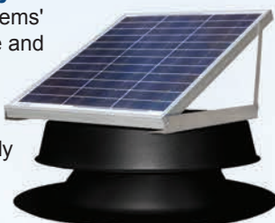
Roof Mount (12, 24, 36, or 60 watt)

Natural Light Energy Systems' Solar Attic Fan is a simple and environmentally sensible solution that can protect your home and save you money. Powered completely by free solar energy, this sleek and efficient vent is both compact and quiet. And let's not forget powerful! The 60 watt model vents up to 3,255 square feet. Solar Attic fans can also be installed in workshops, lofts, storage sheds, garages, barns—any structure that would benefit from improved circulation.